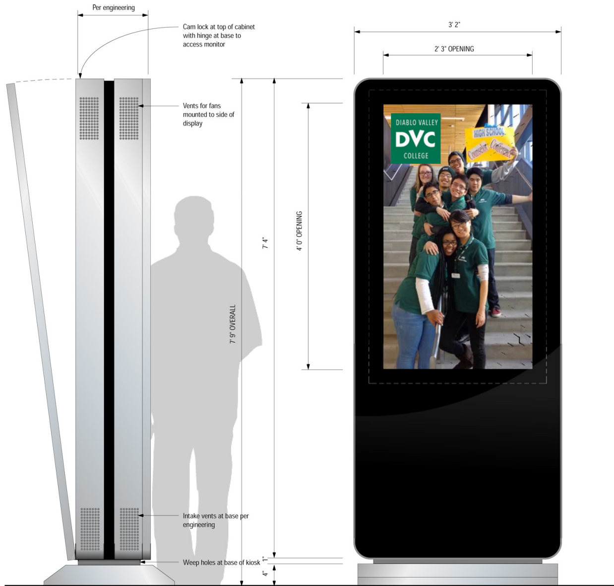
A SIDE VIEW